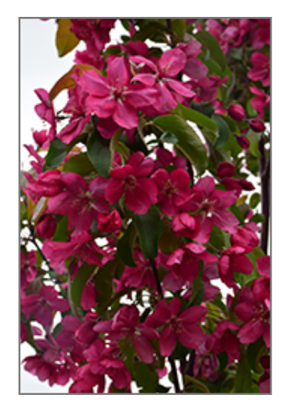
Red Baron Flowering Crab flowers

Red Baron Flowering Crab is a deciduous tree with a narrowly upright and columnar growth habit. Its average texture blends into the landscape, but can be balanced by one or two finer or coarser trees or shrubs for an effective composition.