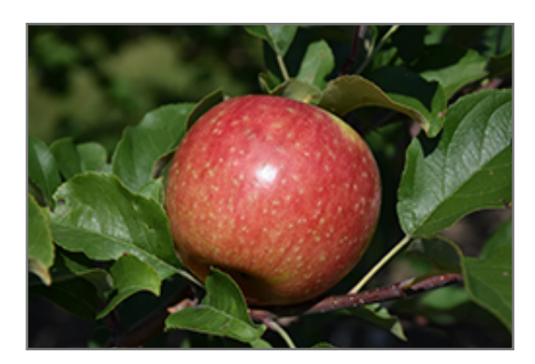
Red Baron Flowering Crab fruit

This is a high maintenance tree that will require regular care and upkeep, and is best pruned in late winter once the threat of extreme cold has passed. Gardeners should be aware of the following characteristic(s) that may warrant special consideration;