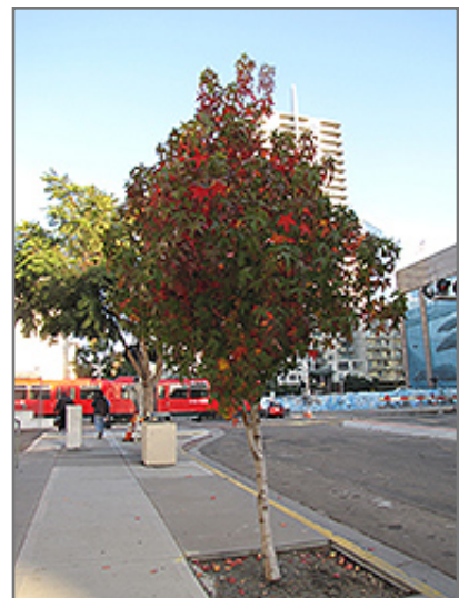
Palo Alto Sweet Gum in fall