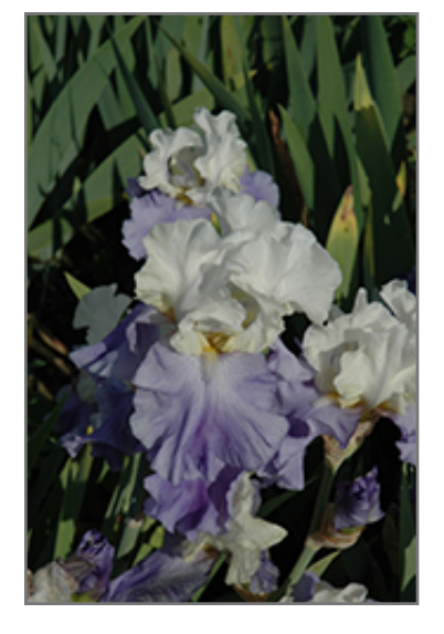
Stairway To Heaven Iris flowers

This lovely iris produces radiant white blooms with sky blue falls and white tipped yellow beards; a stunning addition to the perennial border; also excellent massed in groupings in the garden; will quickly form dense colonies