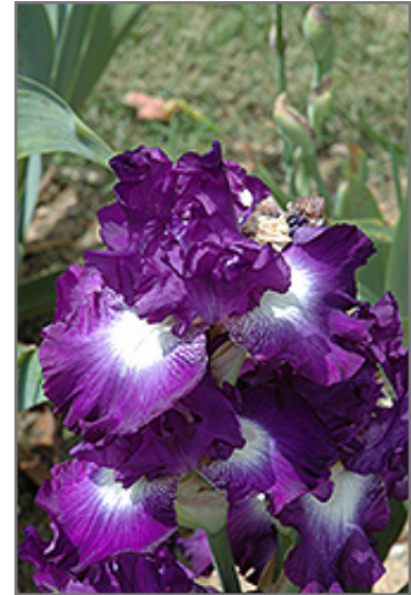
Spot Starter Iris flowers