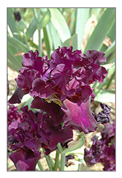
Libra Star Iris flowers

This impressive iris produces lovely blue-violet blooms on tall stems; a stunning addition to the perennial border; also excellent massed in groupings in the garden; will quickly form dense colonies