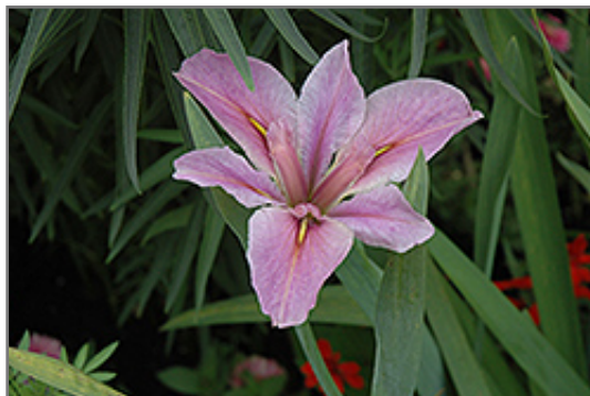
Bryce Leigh Iris flowers

Bryce Leigh Iris is recommended for the following landscape applications;