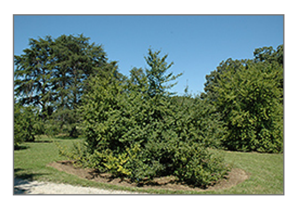
Sundance Possumhaw Holly

A versatile small tree or large shrub with showy orange-red berries throughout winter, requires a male pollinator to produce the berries; does best in moist acidic soils, good for problem areas; excellent when massed