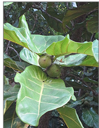
Fiddle Leaf Fig fruit