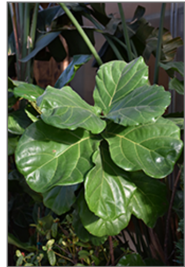
Fiddle Leaf Fig foliage

Fiddle Leaf Fig is recommended for the following landscape applications;