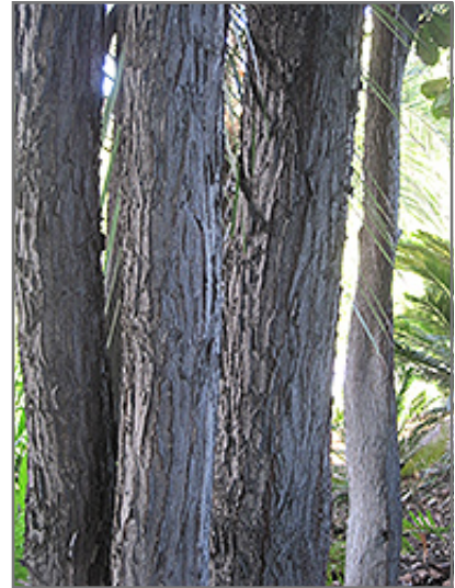
Fiddle Leaf Fig bark

This tree does best in full sun to partial shade. It does best in average to evenly moist conditions, but will not tolerate standing water. It is not particular as to soil type, but has a definite preference for acidic soils, and is able to handle environmental salt. It is highly tolerant of urban pollution and will even thrive in inner city environments. Consider applying a thick mulch around the root zone in winter to protect it in exposed locations or colder microclimates. This species is not originally from North America, and parts of it are known to be toxic to humans and animals, so care should be exercised in planting it around children and pets.