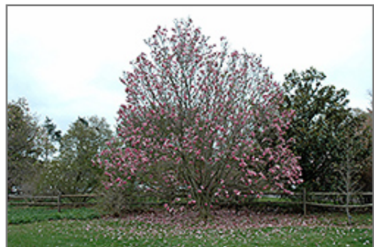
Galaxy Magnolia in bloom