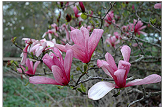
Galaxy Magnolia flowers