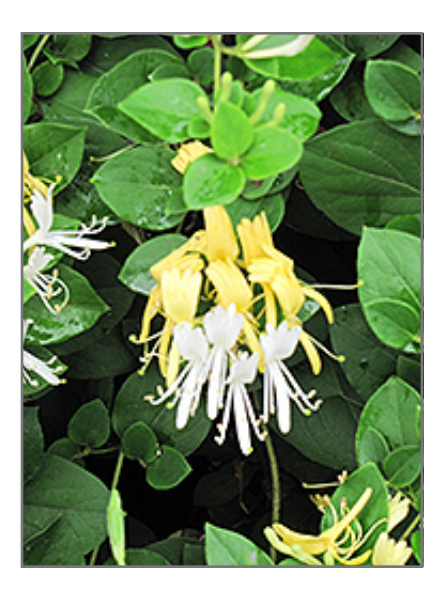
Hall's Japanese Honeysuckle flowers

Hall's Japanese Honeysuckle is recommended for the following landscape applications;