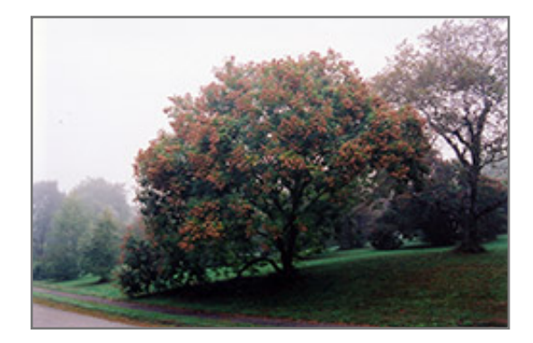
Rose Lantern Golden Rain Tree in fall

This tree will require occasional maintenance and upkeep, and is best pruned in late winter once the threat of extreme cold has passed. Gardeners should be aware of the following characteristic(s) that may warrant special consideration;