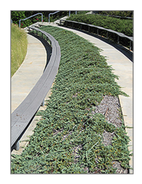
Blue Carpet Juniper