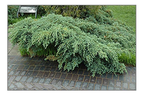
Blue Carpet Juniper

A highly attractive and sophisticated groundcover for discerning landscapers, features soft bluish-gray fine-textured foliage; a highly compact low spreader, with arching branch tips, excellent for massing or as a color accent groundcover