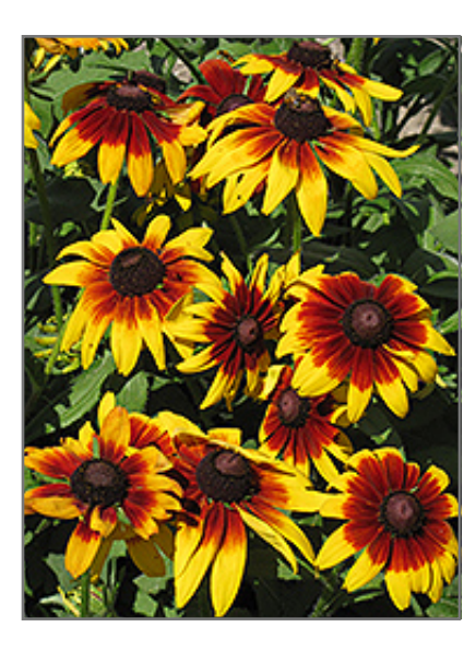
Rustic Dwarf Coneflower in bloom

This compact variety produces large golden yellow daisies with a dark brown eye and burgundy ring; makes an outstanding cut flower; deadhead for re-blooming; drought tolerant once established; wonderful along borders or in containers