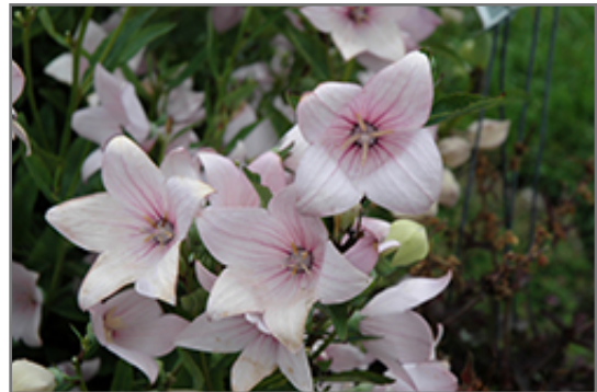
Astra Pink Balloon Flower flowers