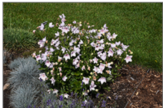
Astra Pink Balloon Flower in bloom