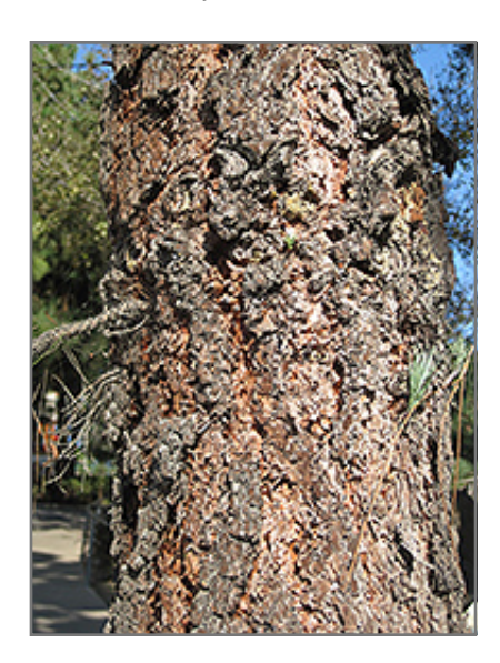
Chir Pine bark