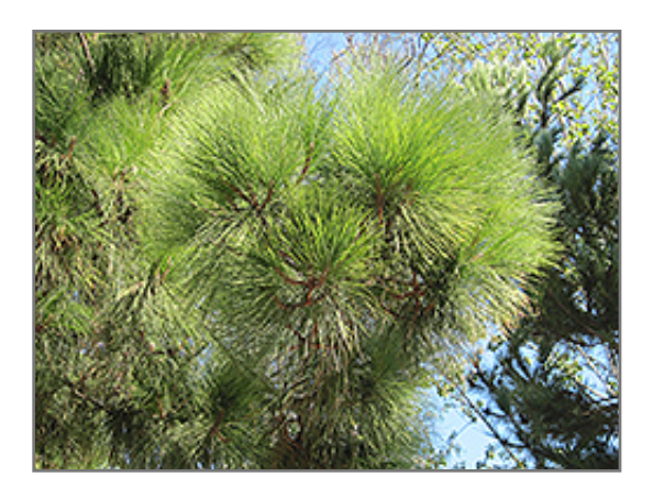
Chir Pine foliage

Chir Pine will grow to be about 80 feet tall at maturity, with a spread of 50 feet. It has a high canopy of foliage that sits well above the ground, and should not be planted underneath power lines. As it matures, the lower branches of this tree can be strategically removed to create a high enough canopy to support unobstructed human traffic underneath. It grows at a medium rate, and under ideal conditions can be expected to live to a ripe old age of 100 years or more; think of this as a heritage tree for future generations!