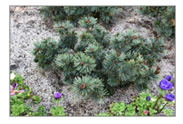
Dwarf Blue Japanese Stone Pine