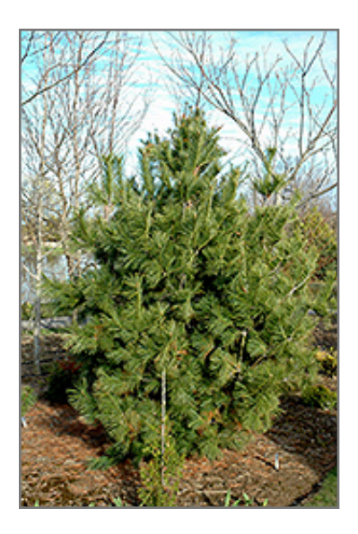
Chinese White Pine