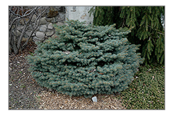
Kluis Blue Spruce