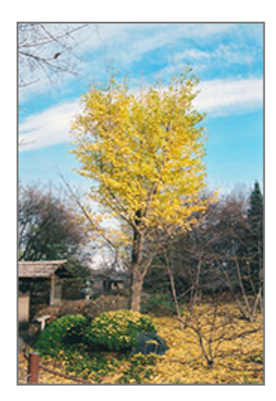
Ginkgo in fall

This tree should only be grown in full sunlight. It is very adaptable to both dry and moist locations, and should do just fine under average home landscape conditions. It is not particular as to soil type or pH, and is able to handle environmental salt. It is highly tolerant of urban pollution and will even thrive in inner city environments. Consider applying a thick mulch around the root zone in winter to protect it in exposed locations or colder microclimates. This species is not originally from North America.