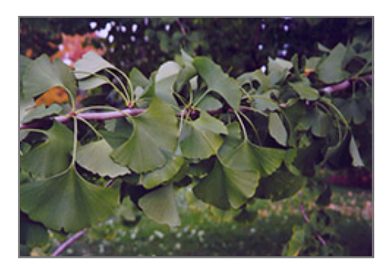
Ginkgo foliage