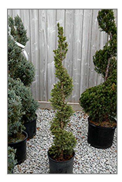
Rainbow's End Spruce (spiral)