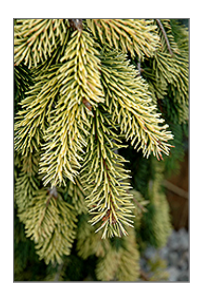
Gold Drift Norway Spruce foliage