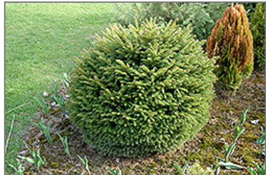
Brabant Norway Spruce