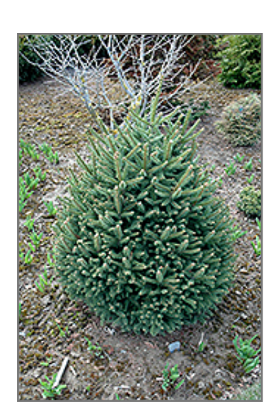
Arnold Dwarf Norway Spruce

Arnold Dwarf Norway Spruce will grow to be about 4 feet tall at maturity, with a spread of 4 feet. It tends to fill out right to the ground and therefore doesn't necessarily require facer plants in front. It grows at a slow rate, and under ideal conditions can be expected to live for 50 years or more.