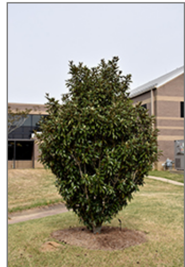
Alta Magnolia