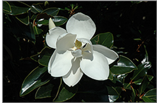
Alta Magnolia flowers