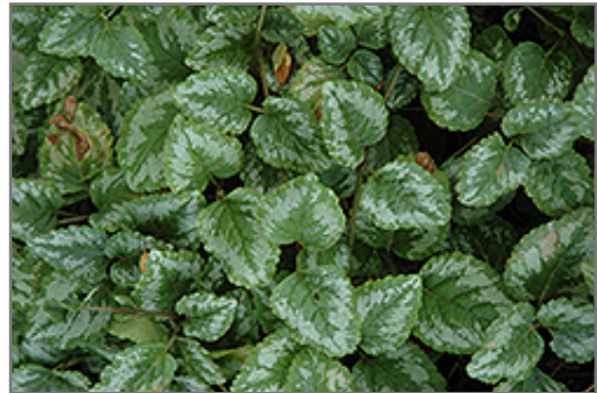
Jade Frost Archangel foliage