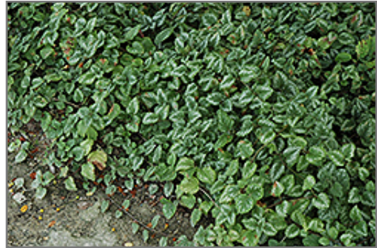
Jade Frost Archangel