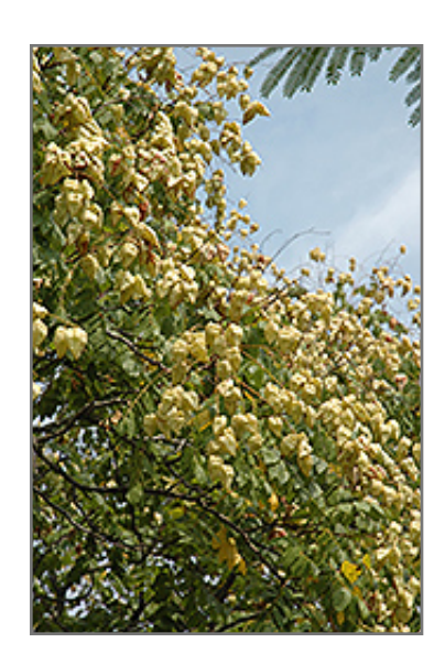
September Golden Rain Tree fruit

This tree should only be grown in full sunlight. It is very adaptable to both dry and moist locations, and should do just fine under average home landscape conditions. It is considered to be drought-tolerant, and thus makes an ideal choice for xeriscaping or the moisture-conserving landscape. It is not particular as to soil type or pH, and is able to handle environmental salt. It is highly tolerant of urban pollution and will even thrive in inner city environments. This is a selected variety of a species not originally from North America, and parts of it are known to be toxic to humans and animals, so care should be exercised in planting it around children and pets.