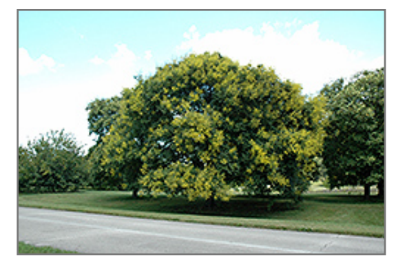
September Golden Rain Tree in bloom

An exceptional small ornamental tree with airy panicles of golden yellow flowers in mid summer, followed by papery brown, lantern-shaped fruit, and beautiful yellow fall color; very adaptable but flowers best in full sun