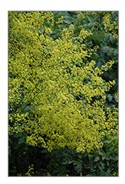
September Golden Rain Tree flowers

This tree will require occasional maintenance and upkeep, and is best pruned in late winter once the threat of extreme cold has passed. Gardeners should be aware of the following characteristic(s) that may warrant special consideration;