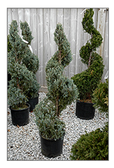
Wichita Blue Juniper (spiral)