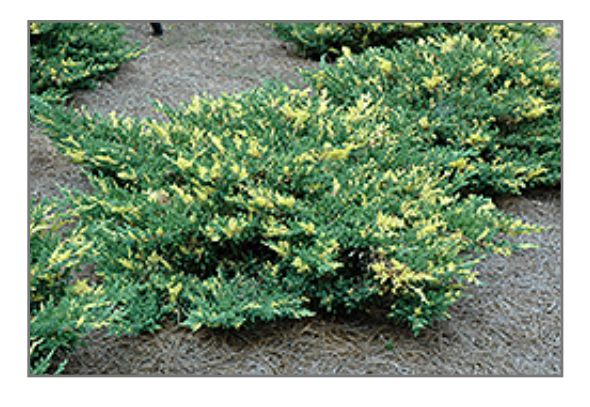
Variegated Japanese Juniper

Variegated Japanese Juniper is a dwarf conifer which is primarily valued in the garden for its broadly spreading habit of growth. It has attractive yellow-variegated bluish-green foliage with hints of powder blue. The scale-like sprays of foliage are highly ornamental and turn plum purple in the fall, which persists throughout the winter. It produces blue berries from late spring to late winter.