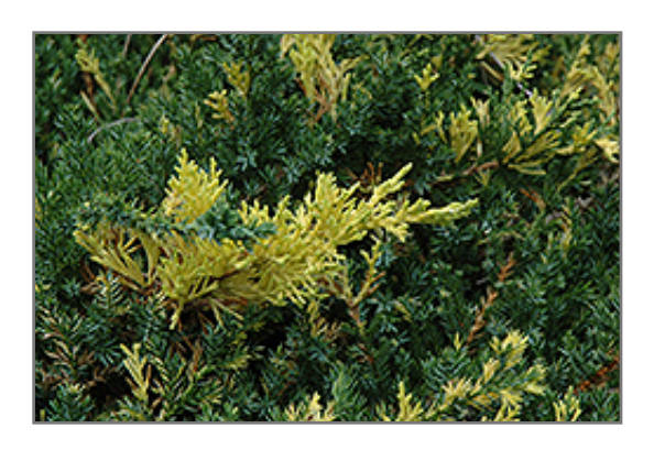
Variegated Japanese Juniper foliage