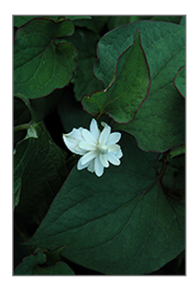
Orange Peel Plant flowers