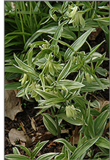
Variegated Japanese Fairy Bells flowers