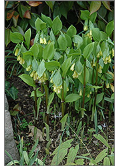
Korean Fairy Bells in bloom