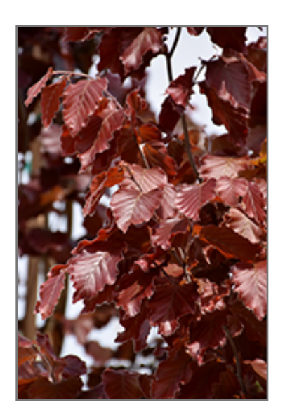
Red Obelisk Beech foliage