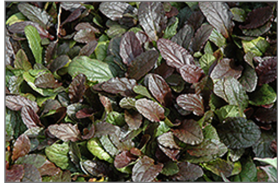
Planet Zork Bugleweed foliage