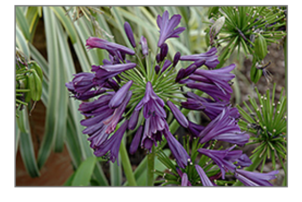
Purple Delight Agapanthus flowers

Other Names: Lily of the Nile, African Lily