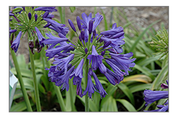
Blue Bayou Agapanthus flowers