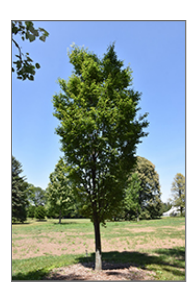
Musashino Zelkova

Musashino Zelkova will grow to be about 45 feet tall at maturity, with a spread of 15 feet. It has a high canopy with a typical clearance of 6 feet from the ground, and should not be planted underneath power lines. As it matures, the lower branches of this tree can be strategically removed to create a high enough canopy to support unobstructed human traffic underneath. It grows at a fast rate, and under ideal conditions can be expected to live for 70 years or more.