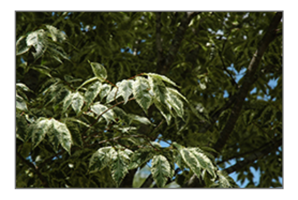
Goshiki Variegated Zelkova foliage