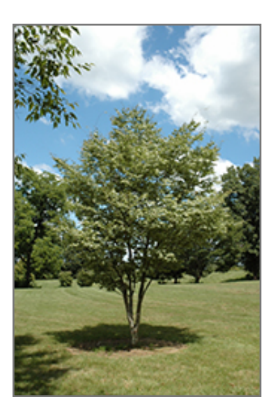
Goshiki Variegated Zelkova