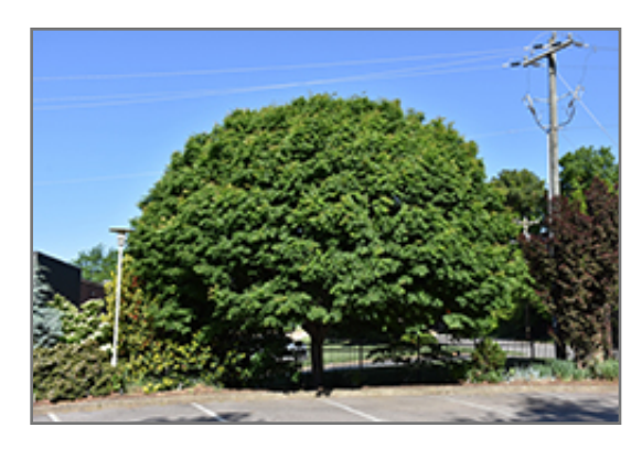
City Sprite Zelkova

City Sprite Zelkova will grow to be about 20 feet tall at maturity, with a spread of 18 feet. It has a low canopy with a typical clearance of 5 feet from the ground, and is suitable for planting under power lines. It grows at a fast rate, and under ideal conditions can be expected to live for 70 years or more.