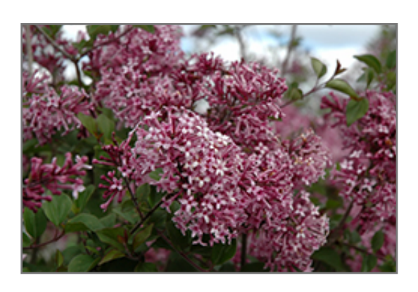
Bloomerang Purple Lilac flowers

A dwarf hybrid lilac that's just the right size for the garden, producing a plethora of sweetly fragrant lavender-purple flowers in late spring; reblooms constantly throughout the summer showing color until fall