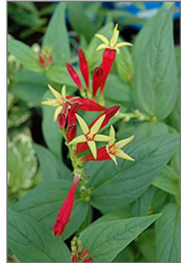
Indian Pink flowers

Indian Pink is recommended for the following landscape applications;