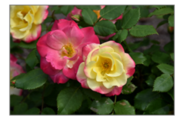
Campfire Rose flowers

A beautiful variety producing clusters of pink and white blooms with intense yellow centers; habit is upright with vigorous dark green glossy foliage that is very resistant to blackspot; all roses need full sun and well-drained soil