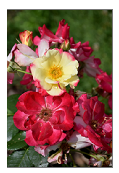
Campfire Rose flowers

This shrub will require occasional maintenance and upkeep, and is best pruned in late winter once the threat of extreme cold has passed. It is a good choice for attracting bees and butterflies to your yard. Gardeners should be aware of the following characteristic(s) that may warrant special consideration;