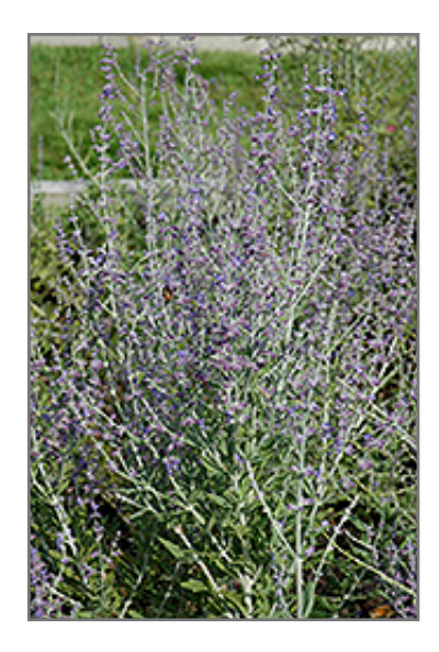
Taiga Russian Sage flowers