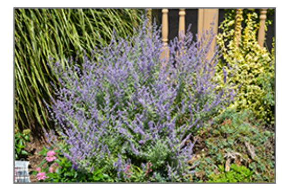
Rocketman Russian Sage in bloom

Rocketman Russian Sage is recommended for the following landscape applications;