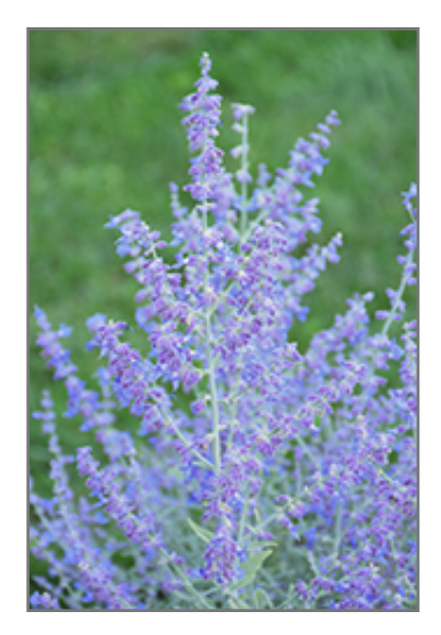
Rocketman Russian Sage flowers