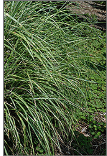
Little Zebra Dwarf Maiden Grass foliage