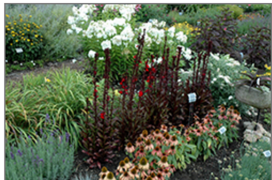
Vulcan Red Lobelia in bloom