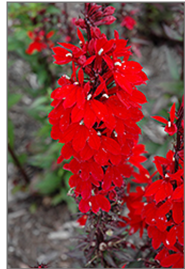
Vulcan Red Lobelia flowers

Vulcan Red Lobelia is recommended for the following landscape applications;