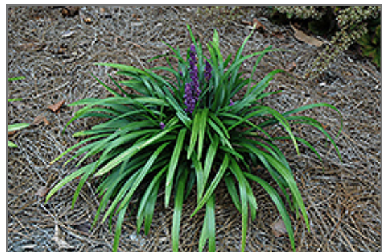
Royal Purple Lily Turf in bloom