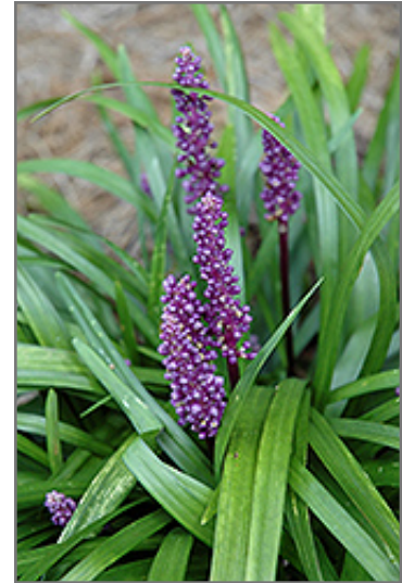
Royal Purple Lily Turf flowers

Royal Purple Lily Turf is recommended for the following landscape applications;