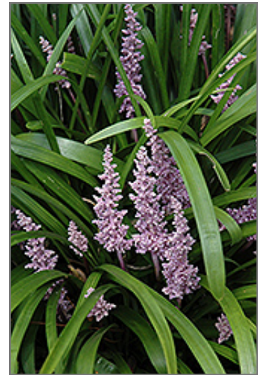
Lily Turf flowers

Lily Turf is recommended for the following landscape applications;