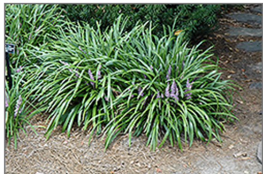
Lily Turf in bloom