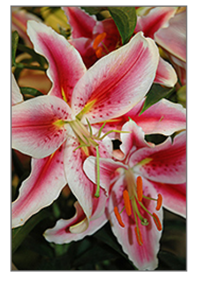
True Romance Lily flowers