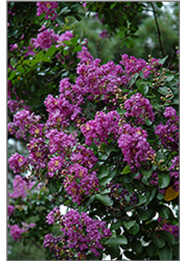
Powhatan Crapemyrtle flowers