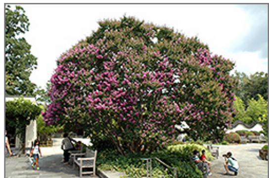
Powhatan Crapemyrtle in bloom