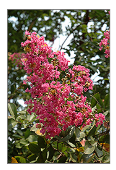
Wichita Crapemyrtle flowers