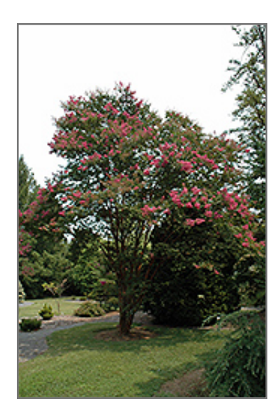
Wichita Crapemyrtle in bloom